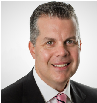
J.P. Girard Green Shield CANADA

The Pandemic has had implications on all facets of our business. For benefit plans in particular, the focus took a sharp turn from volatility in increased utilization and rising costs being primary concerns, mental health supports being under-utilized, and virtual therapies being just talked about and overpriced. This session will look back on plans pre-COVID-19 versus future plan designs in a post pandemic world - what lessons have we learned? Hear from our panelists as we explore breaking down the barriers to access care with virtual solutions; modernizing plan designs to ensure adequate mental health supports; and addressing benefits that are equally inclusive and comprehensive. From the carrier, consultant, and mental health specialist vantage points – what does this new landscape look like?